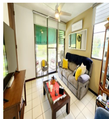
SEE THIS PROPERTY IN MAP