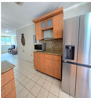
SEE THIS PROPERTY IN MAP